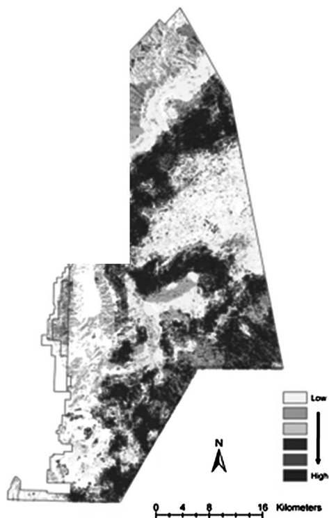
Figure 1. Habitat suitability model for Aplomado Falcons on the Armendaris Ranch. Map subset from model detailed in report (Young et al. 2002).

The Peregrine Fund employed standard raptor hacking (reintroduction) procedures for releasing 102 captive-bred Aplomado Falcons at the Armendaris Ranch from 2006 through 2011 in June, July, and August (Hunt et al. 2013). This procedure involved holding juvenile aplomados, with color VID (visual identification) and aluminum U.S.G.S. bands, in a hack box, for 7–10 d, on an elevated platform erected in suitable habitat, and then releasing them at an age when they would naturally fledge (Mutch et al. 2001). On release day, the box was opened remotely allowing the birds to emerge