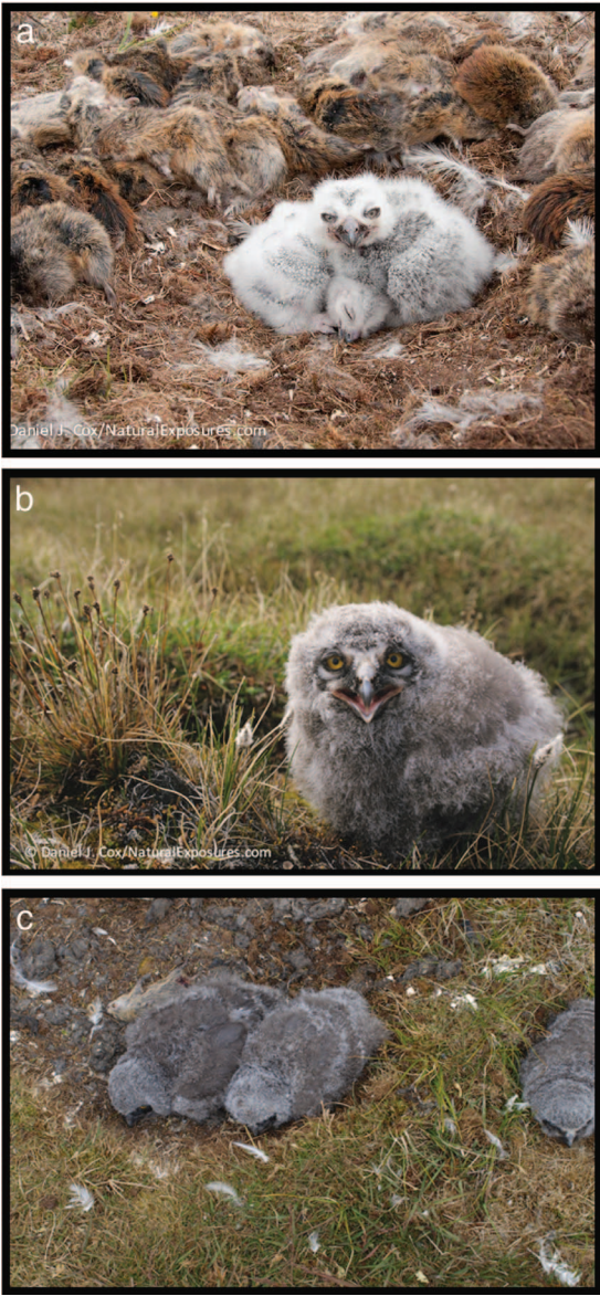
Figure 3. (a) Eyes yellow-gray and open fully by 9–11 d. (b) Nestlings gray with frosted tips to mesoptile down; primary quills emerge by day 14. (c) Nestlings gray, tail quills visible, primary feathers erupt, surge in mass gains, very mobile, 15–21 d.

mesoptile (second) natal down at about 1 wk of age, and within 2 wk of age they were mostly covered in the mesoptile down. These findings were similar to other studies (Sutton and Parmelee 1956, Watson 1957, Tulloch 1968, Potapov and Sale 2012).