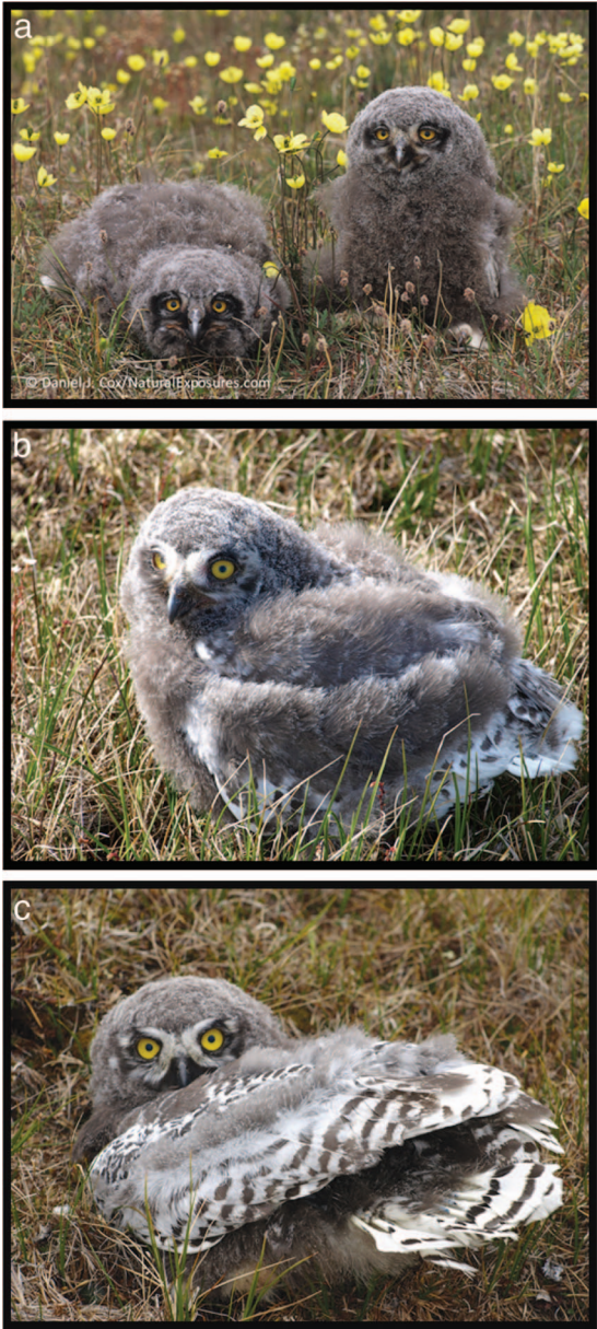
Figure 4. (a) Very mobile, can run, departs nest about 3 wk old, tail feathers conspicuous. (b) Eyes deeper yellow; juvenile plumage emerges, showing white X on face 22–28 d; tail quills erupt about 25 d. (c) White mask forms on face, juvenile upper wing coverts and flights feathers distinct at 29–35 d.

mesoptile (second) natal down at about 1 wk of age, and within 2 wk of age they were mostly covered in the mesoptile down. These findings were similar to other studies (Sutton and Parmelee 1956, Watson 1957, Tulloch 1968, Potapov and Sale 2012).