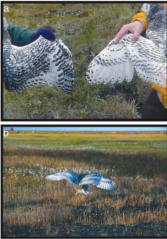
Figure 5. (a) Distinct plumage patterns suggest sex differences between male and female at 36–43 d. Notice less barring and more spotting on male secondaries and more barring and less spotting on female secondaries. (b) Young fledge around 44–55 d.

(see Bruce 1999, Holt et al. 1999, König and Weick 2008), and mesoptile down varies in color among species. Most species of owls are nocturnal or active at low-light levels, and only females incubate and brood. Thus, we hypothesize that there is no need for eggs or nestlings to evolve cryptic coloration because they are almost constantly covered by the female. Thus, white may be a neutral or default color favored by natural selection, and energetically cheaper to produce.