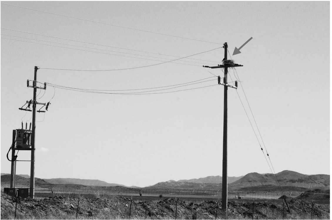
Figure 4. Aplomado Falcon nest adjacent to farmland in Chihuahua, Mexico.

and other management practices are worthy of immediate consideration in view of the predicted negative consequence of inaction.