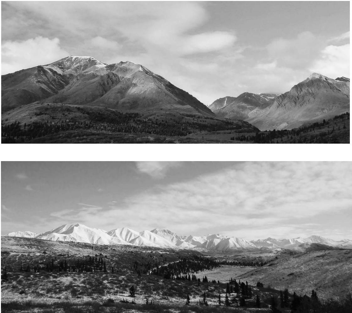
Figure 3. View looking to the northwest (top) and northeast (bottom) from an autumn observation site near Lost Creek on the southern slopes of the Mentasta Mountains, October 2014. In autumn, most Golden Eagles were detected as they migrated along the higher ridges of the Mentasta Mountains to the north of the observation site.

low along slopes or circling low over the landscape) and 91 appeared to be primarily intent on migrating. We did not observe any white feathering on most of the eagles we detected in spring 2014. We counted for 91 hr between 1000 and 1900 H on 17 d from 12–28 March 2015. Weather conditions ranged from days with clear skies to days with snowstorms that limited visibility to <1 km. Winds were primarily from the northeast and temperatures ranged from –32 to +4°C. We detected 402 migrating Golden Eagles (4.4 migrating eagles per observation hr) during spring 2015, most (303) from 17–21 March when we counted from an east-